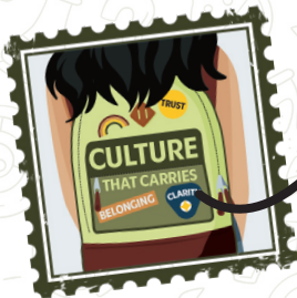
SESSION 3 STICKER

Complete the series to unlock the full perspective!